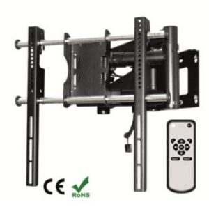
Swivel and Tilt

If cost is not a factor and comfort is, then go for the Remote controlled model .